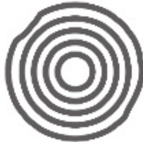
Solid Wood housing