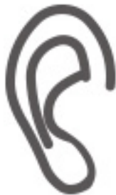
Ergonomic Raindrop Earpad